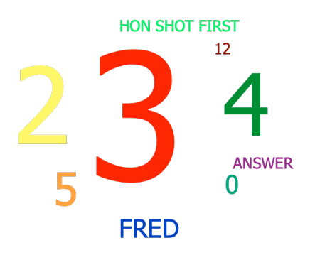
4. Please do Question 4 which is displayed on the screen in class. (Short Answer)